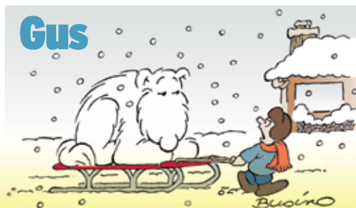
"COLD FEET OR NO COLD FEET... THIS CAN HARDLY BE CONSIDERED GOING FOR A WALK!"